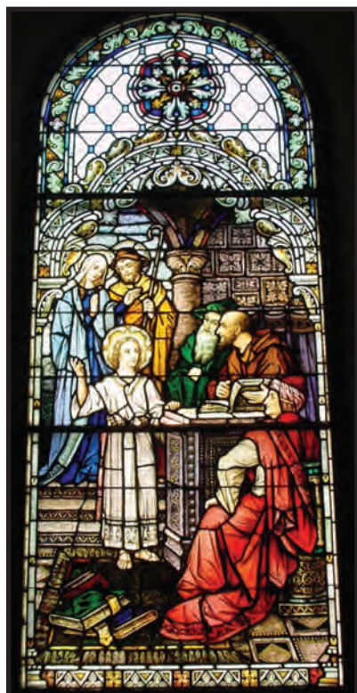
The Finding of the Child Jesus in the Temple

But the Joyful Mysteries concentrate on the very earliest times of His life: the Annunciation, when the Archangel Gabriel announces to Mary what is going to happen; the Visitation to Elizabeth, when Mary is carrying Our Lord in Her womb and Elizabeth has John the Baptist in her womb; the Nativity, the moment of the Birth; and then the Presentation which comes shortly after the birth. The Feast of the Purification is February 2, so a set number of days after the birth of Our Lord, Mary goes and takes the Child Jesus to the temple. And at that moment St. Simeon sees Our Lord and recognizes what has happened,