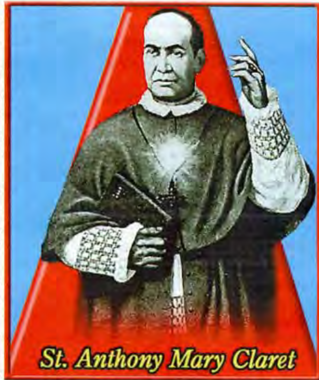
St. Anthony Mary Claret

In this very folly they have punishment. They have not wanted to see, and have remained blind. They have withdrawn from the source of All Good and have plunged into the sea of all evil. They have hated life and have fallen into the darkness of death. "If the just man turn himself away from his justice ... shall he live? No, he shall not live." (Ezech. 18:24).