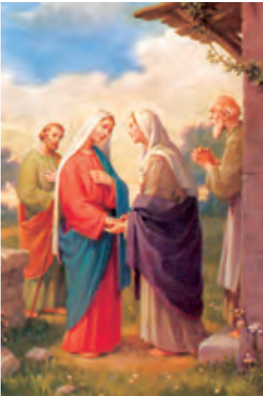
2. THE VISITATION: And Elizabeth was filled with the Holy Ghost, and cried out with a loud voice, saying, “Blessed art Thou among women and blessed is the fruit of Thy womb!” Luke 1, 41-42