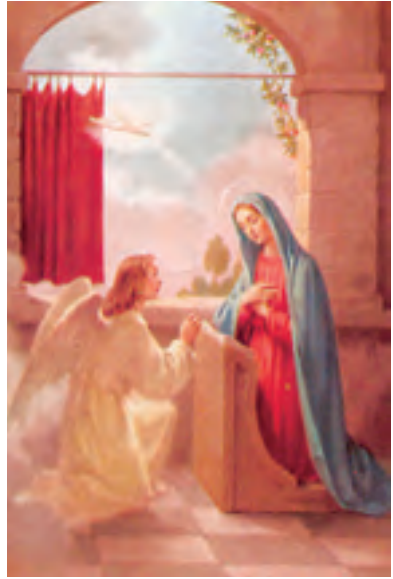
1. THE ANNUNCIATION: And when the angel had come to Her, he said, “Hail, full of grace, the Lord is with Thee, blessed art Thou among women.” Luke 1, 28

“But they will do better still and will please me even more if they say these Hail Mary’s while meditating on the Life, Death and Passion of Jesus Christ — for this meditation is the soul of this prayer.”