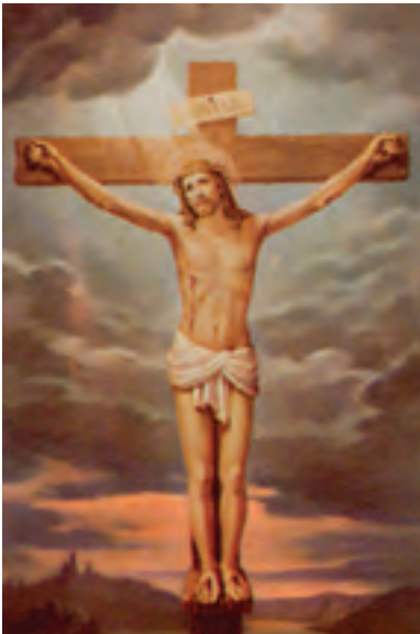
5. THE CRUCIFIXION: And Jesus cried out with a loud voice and said: "Father, into Thy hands I commend My spirit." And having said this, He expired. Luke 23, 46