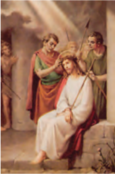
3. CROWNING WITH THORNS: And they stripped Him and put on Him a scarlet cloak; and plating a crown of thorns, they put it upon His head, and a reed in His right hand. Matthew 27, 28-29