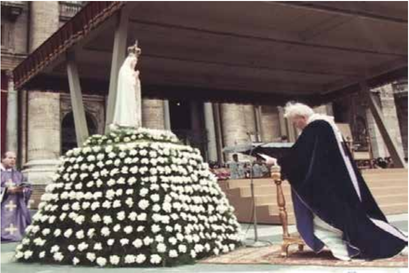
Pope John Paul II, kneeling before the statue of Our Lady of Fatima, consecrates the world to the Immaculate Heart of Mary. This statue was brought for the occasion to Rome by the Bishop of Fatima himself.

that Our Lady will bless “those peoples for whom You Yourself are awaiting our act of consecration and entrusting,” thus once again acknowledging that he had not fulfilled that request on March 25. The same remarks were reported in the Italian edition of L’Osservatore Romano on March 26-27.