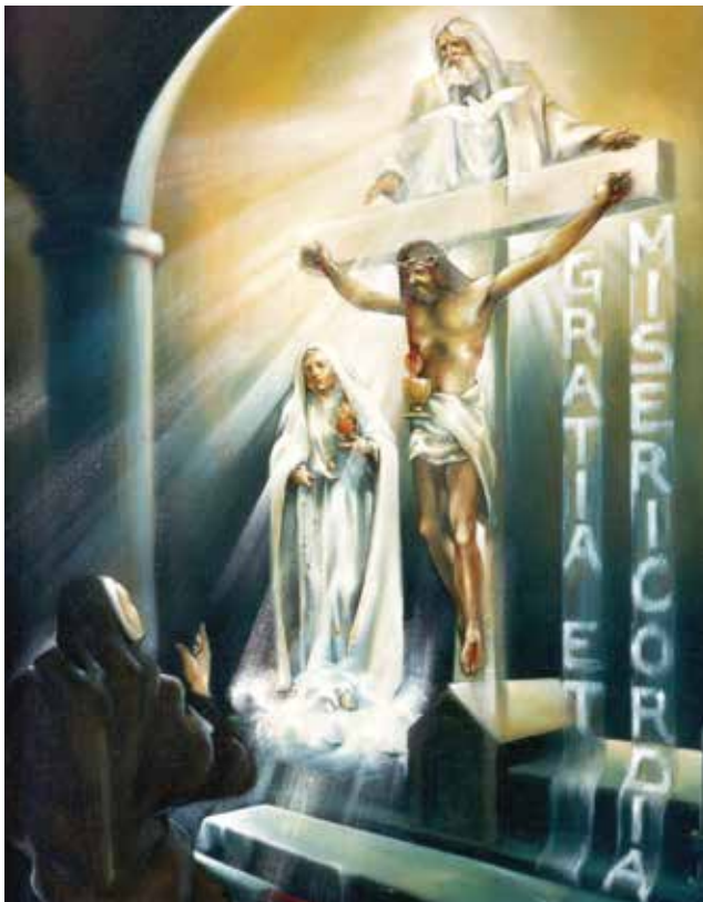
The Vision of Tuy, June 13, 1929

beginning of the third part (Third Secret) in her Memoirs.