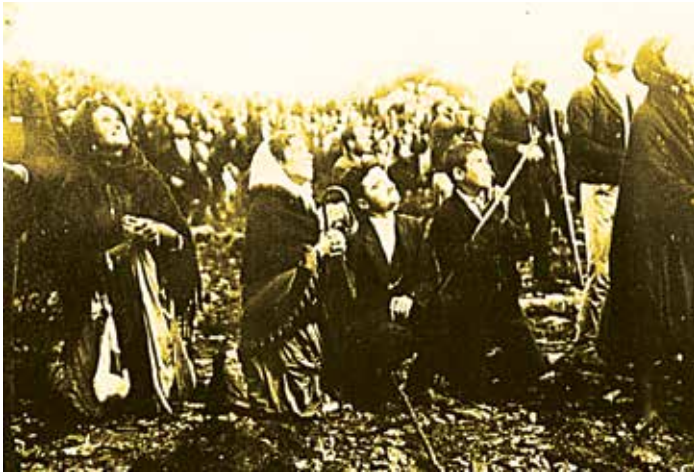
A photograph of part of the 70,000 witnesses as they are actually observing the Miracle of the Sun at Fatima on October 13, 1917.

Catholic Faith. Even atheists and anticlerical news reporters, present to scoff at the event, admit that the miracle occurred. Nothing like this miracle, announced in advance, has ever occurred in the history of the world.