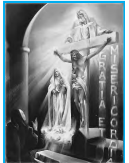
The Vision of Tuy

Today we will continue to Covadonga , nestled in the mountains. In Covadonga we will visit the Shrine of Our Lady dating back over 1000 years ago when the Catholic reconquest of Spain was started against overwhelming odds, where angels were seen to fight on the side of the Catholics. Overnight near Covadonga.