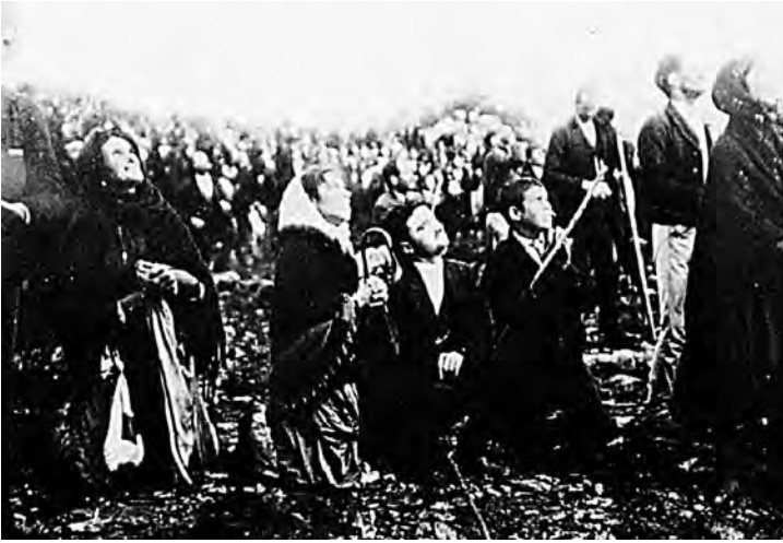
Part of the 70,000 witnesses of the October 13, 1917 Miracle of the Sun

The newspaper report from October 15, 1917, said: